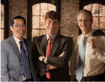
From right to left: